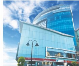
PARAS DOWNTOWN CENTER Delivered