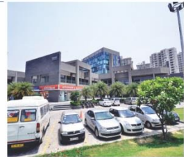
PARAS TRADE CENTRE Delivered