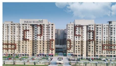
PARAS SEASONS Delivered