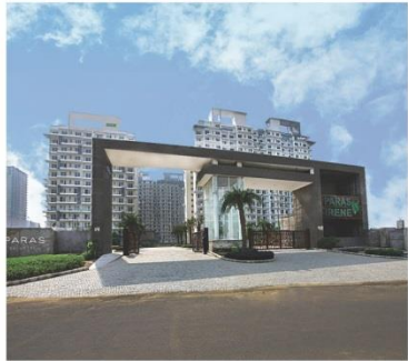
PARAS IRENE Delivered