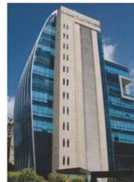
PARAS TWIN TOWERS Delivered

In over a decade since its inception, stability and timely delivery have become hallmark of Parus Buildtech. In this span, the company has delivered approx. 6.5 million sq. feet and is working on multi scale projects.