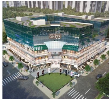
PARAS ONE33 On going