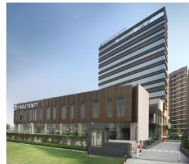
PARAS TRINITY Delivered